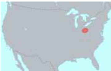
Shawnee distribution around 1755

This arrangement gradually changed due to the scattering of the Shawnee tribe from the seventeenth century through the nineteenth century.